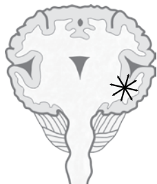
Focal or partial seizures originate in one part of the brain.

A simple partial seizure can progress to a complex partial seizure and/or a secondarily generalized seizure .